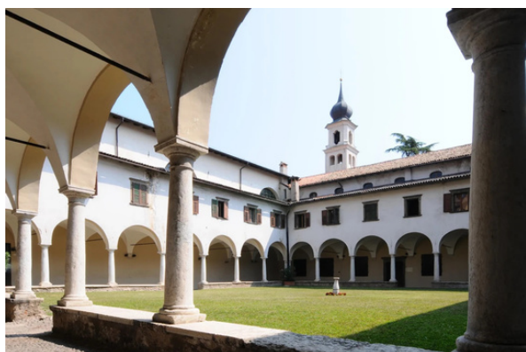
OECD, Vicolo San Marco 1