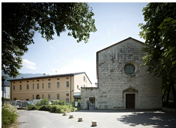
FBK, Via Santa Croce 77